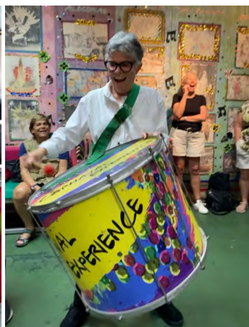
Fifth stop: Rio de Janeiro, Brazil