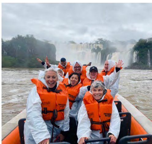
Fourth stop: Iguazu Falls, Argentina and Brazil