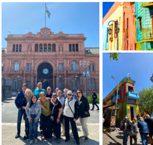
Third stop: Buenos Aires, Argentina