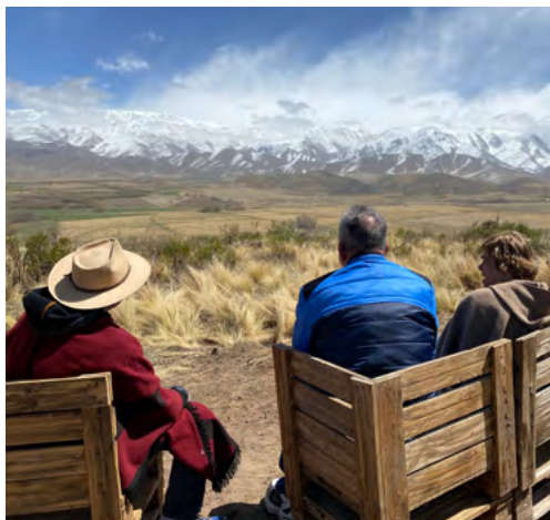
Second stop: Mendoza, Argentina