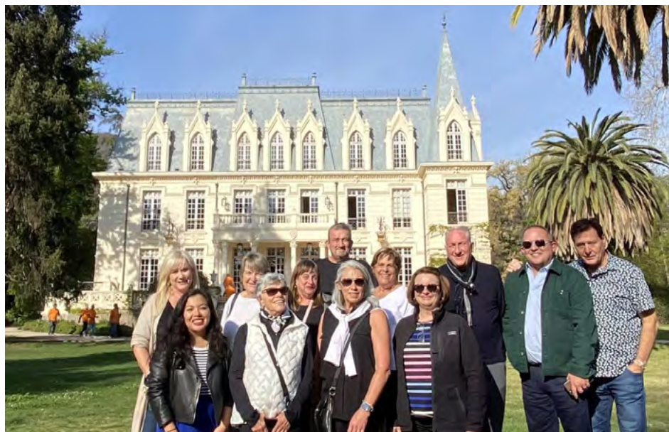
First stop: Las Majadas de Pirque, in Chile