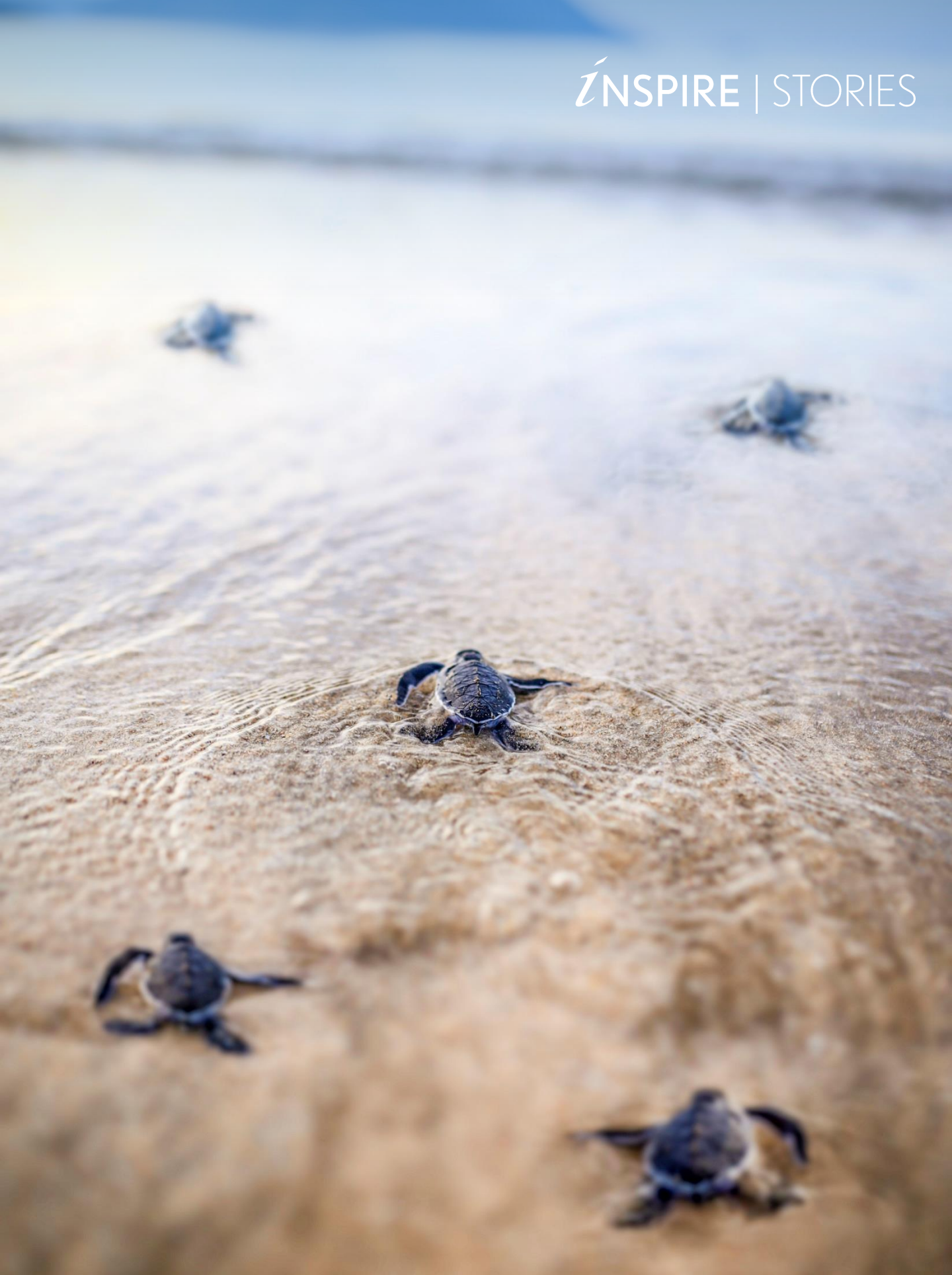
Baby turtles take their first steps during hatching season which can be seen in August at Six Senses Con Dao, Vietnam Cover photo: A scene from the epic Ramayana legend painted on the walls of the Grand Palace in Bangkok, Thailand