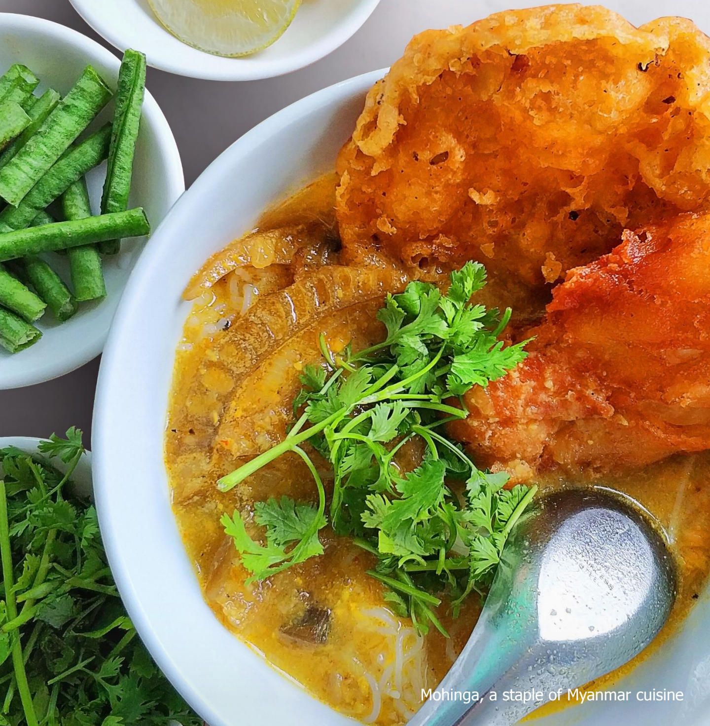
Mohinga, a staple of Myanmar cuisine