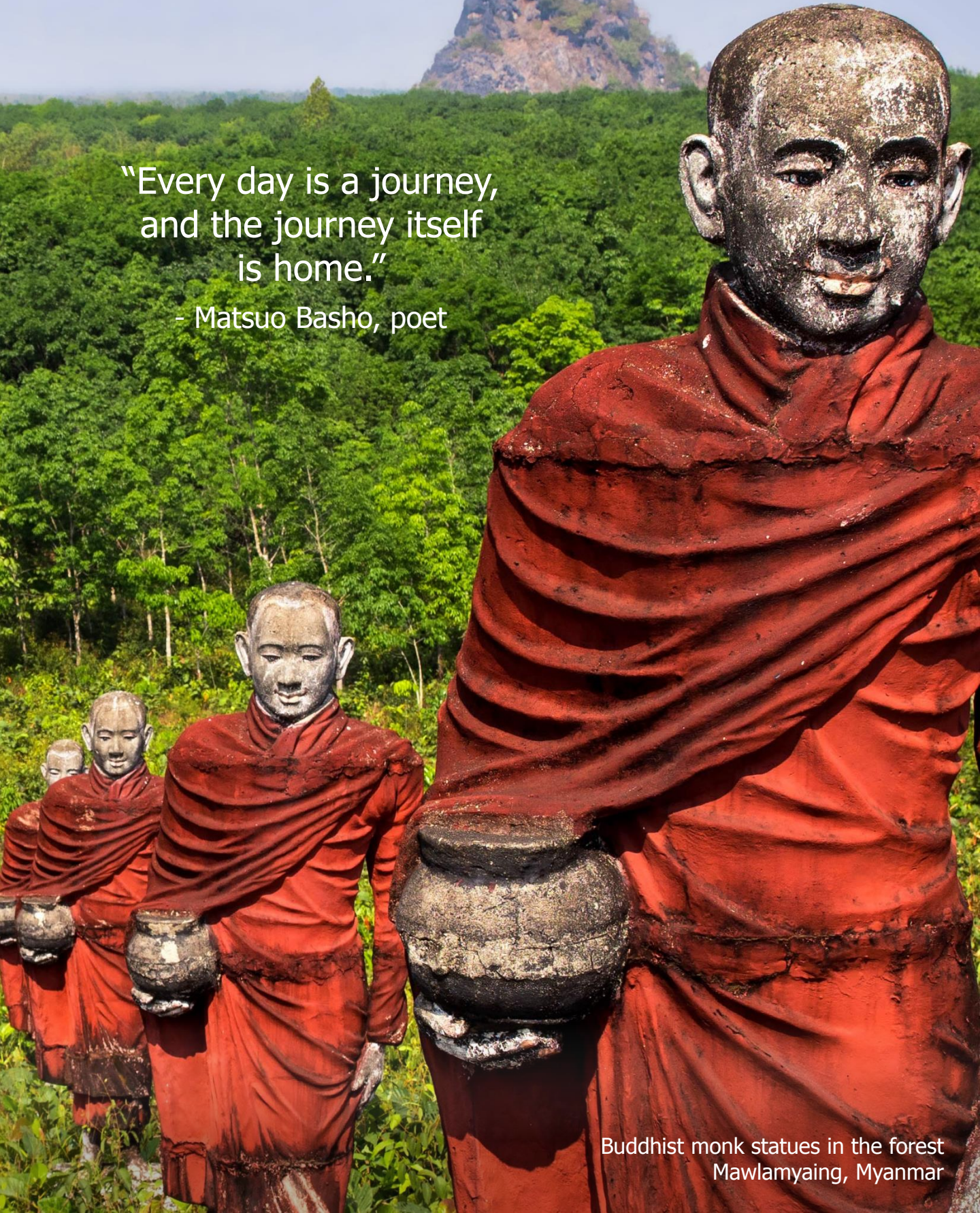
Buddhist monk statues in the forest Mawlamyaing, Myanmar