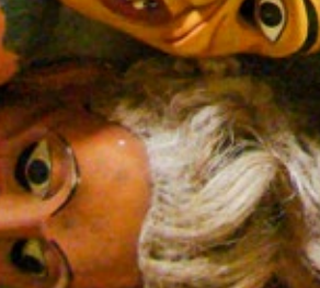
SRI LANKA AKORN DESTINATION MANAGEMENT

Being such a small, yet diverse island, means we can pack single days full of adventure. As designed for our Founder and CEO on his private tour of Sri Lanka, we are able to show guests the blue whale by air, let them indulge in fresh seafood on the east coast's sandy beaches, fly to the mountains for an escorted walk through a tea estate and spot the elusive leopard in Yala National Park, all in one day!